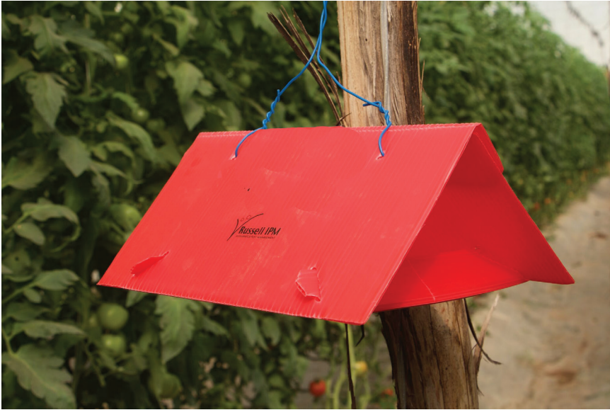
Figure 12.5 Pheromone traps are an ideal for the monitoring of Lepidoptera pests in both indoor and outdoor growing areas that are commonly affected by this type of pest.