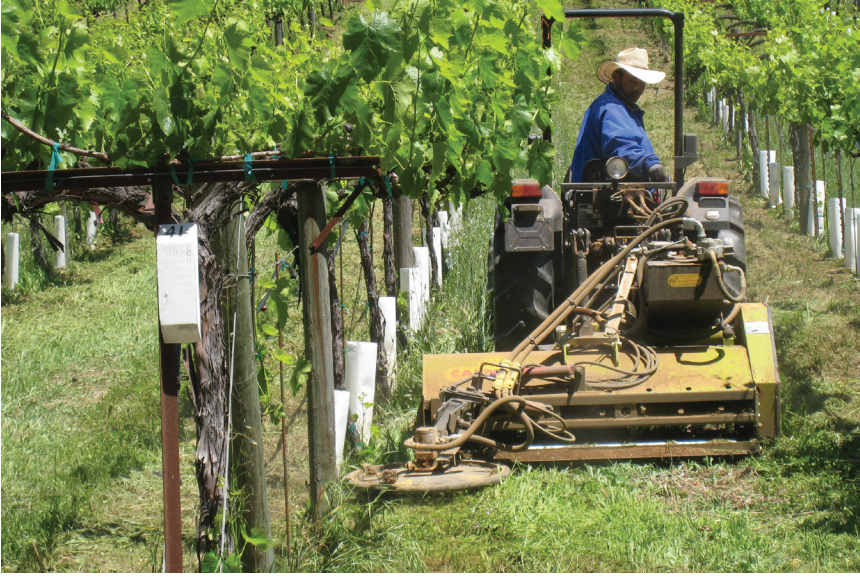
Figure 14.16 Under-the-trellis retractable rotary mower.