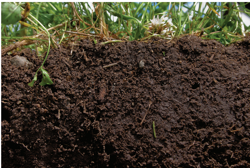
Figure 4.1 Soil organic matter is the very foundation for healthy and productive soils.