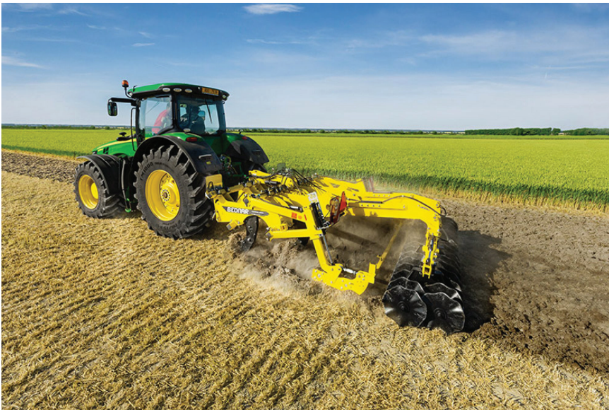
Figure 5.1 Deep soil tillage

Primary tillage is the first soil tillage after the last harvest, which involve loosening the soil, inverting the soil, and uprooting weeds and crop stubble (See Figure 5.1). Primary tillage techniques are always aggressive and usually carried out at considerable depth, leaving an uneven soil surface. For weed species that are propagated by seeds, primary tillage can contribute to control by burying a portion of the seeds at depths from which they are unable to emerge. Primary tillage can also play a role in controlling perennial weeds by burying some of their propagules deep, thereby preventing or slowing down their emergence. Some of the propagules can be brought up to the soil surface, where they will be exposed directly to cold or warm temperatures or desiccation conditions. The implements used to perform primary tillage include moldboard plows, chisel plows, disk plows, rotary tillers, and spading machines.