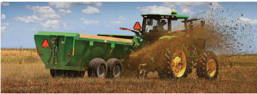
Figure 9.3 Side-discharge box spreader

Side-discharge spreaders are open-top spreaders that use augers within the hopper to move wet manure toward a discharge gate (See Figure 9.3). Manure is then discharged from the spreader by either a rotating paddle or set of spinning hammers. Side-discharge spreaders provide a uniform application of manure for many types of manure with the exception of dry poultry litter. Side discharge units can handle materials with a wide range of moisture contents making them a great fit where manure is too solid for a tanker, but too loose for a box spreader, like sand-laden pit manure.