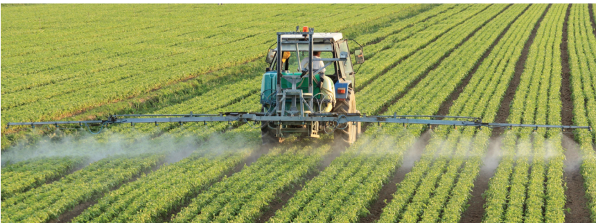
Figure 1.1 Farmer spraying pesticides

Technological advances during World War II accelerated post-war innovation in all aspects of agriculture, resulting in big advances in mechanization (including large-scale irrigation), fertilization, and pesticides. In particular, two chemicals that had been produced in quantity for warfare were re-purposed to peace-time agricultural uses. Ammonium nitrate became an abundantly cheap source of nitrogen, and a range of new pesticides appeared—DDT launching the era of widespread pesticide use. These technical advances resulted in significant economic benefits; however, the rise in chemical treatments greatly worried organic farmers and consumers in the post-war era. In the 1940s, an international campaign called the Green Revolution was launched in Mexico leading to the development of new disease resistance high-yield varieties of wheat. By combining the wheat varieties with new mechanized agricultural technologies, Mexico was able to produce more wheat than was needed by its own citizens, leading to its becoming an exporter of wheat by the 1960s. Prior to the use of these varieties, the country was importing almost half of its wheat supply. The Green Revolution encouraged the development of hybrid plants, chemical controls, large-scale irrigation, and heavy mechanization in agriculture around the world. During the 1950s, sustainable agriculture was a topic of scientific interest, but research tended to concentrate on developing the new chemical approaches (See Figure 1.1).